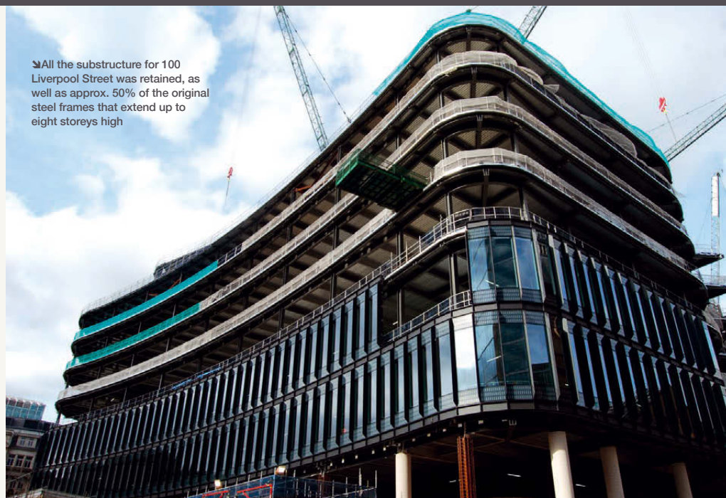
➤ All the substructure for 100 Liverpool Street was retained, as well as approx. 50% of the original steel frames that extend up to eight storeys high

These partial and incomplete analyses use data that can be called ‘cradle-to-gate’, as they only consider the impacts from extraction and