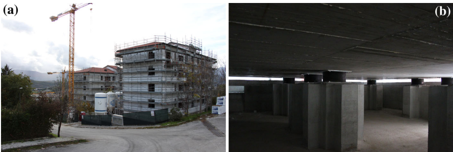
Fig. 13 Via Francia, Pettino. a Photo of the base-isolated buildings and b view of the base isolators in the basement

masonry, and dressed stone blocks. Walls in a few cases appear to be massive, but most commonly are formed by the so called “muratura a sacco”, namely two wythes of dressed stones poorly connected, sometimes with a rubble infill. Mortar is mainly lime mortar. Large squared stone blocks are used for quoins. A typical intervention that was observed to be extensively used at the few sites which were undergoing restoration at the time of the EEFIT mission and that could be visited is fluid mortar injection grouting of all bearing walls. The aim of such an intervention is to improve the coherence and cohesion of existing walls by injecting them with fluid grout through a series of drilled holes regularly spaced on a 500 mm grid and proceeding from the bottom to the top, after having sealed and repointed the mortar joint. Although for material compatibility only lime-based grouts should be used, often epoxy additives or cement are included in the mix for faster setting. While such additive might improve the short term strength and cohesion of the masonry, they can create serious long term problems in terms of decay of the original materials due to different hydro-thermal behaviour and salt content.