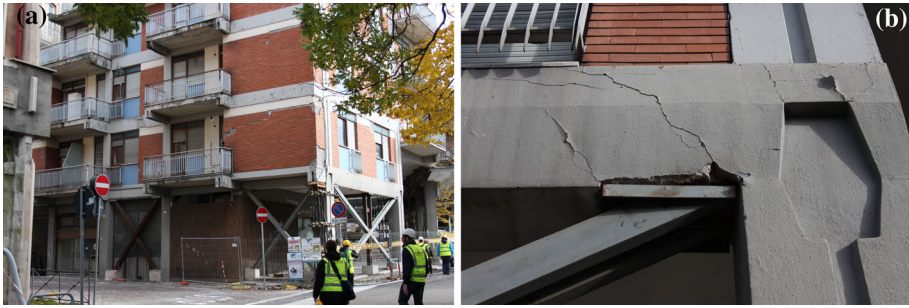
Fig. 4 Shoring of a Reinforced Concrete structure to prevent soft storey collapse. a Building elevation b shoring bearing against existing structure

of reinforced concrete structures that are stable in the temporary condition but require retrofit to return them to full service. It should also be noted that severely damaged reinforced concrete structures had either collapsed or been demolished at the time of the EEFIT return mission.