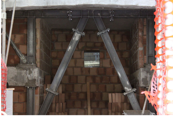
Fig. 12 Condominio Vico Picenze, L’Aquila. Retrofitted steelwork observed from the site boundary