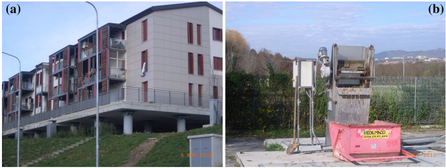
Fig. 8 Photograph of a C.A.S.E. building in the Bazzano site (a), and the inadequate sewage filtering site alongside the Aterno river (b)

was published just before the earthquake. One of the main issues discussed in the plan is the legacy of the C.A.S.E. settlements (locally termed “New Towns”) in a perspective of reshaping the suburban configuration. The Plan envisages the necessity to change from a single-centred city model to a multi-centred model; it sees the frazioni as adding new value to the city (Comune di L’Aquila 2011, p. 42). It promotes a change from the C.A.S.E. sites providing only a residential function to a multifunctional offer of spaces and services. The latter was strongly requested by the municipality in the planning phase of the C.A.S.E. sites, in fact, 30 % of the 19 New Towns’ gross surface (percentage defined by the General Regulatory Plan—Comune di L’Aquila 2011) is reserved for public facilities with social provisions (schools, health centres and parks) and facilities for locally based commercial activities (food shops, laundry services, tobacco stores, stationaries, bars, professional studies and bank offices). A fundamental aspect of the plan is to balance the depopulation of the C.A.S.E. sites—which will characterize the settlements while people will progressively return to their rebuilt or repaired houses—through the “inclusion of new social groups: young couples, students, teaching staff, researchers, artists, touristic receptivity, etc.”, supported by a more efficient delocalised network of social services (Comune di L’Aquila 2011, p. 43).