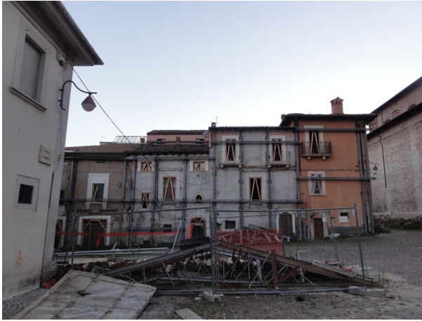
Fig. 5 Example of an aggregate: four distinct building units sharing party walls

The Filiera's mandate ended at the end of 2012. To achieve a smooth handover of the building approval process to the Municipalities, at the end of the Filiera's support period the ordinance 3803/2009 of the Prime Minister established that CINEAS and RELUIS must provide training sessions to municipal employees.