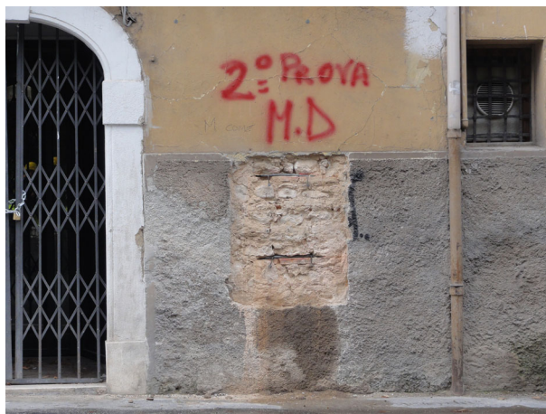
Fig. 6 Photo of typical double flat-jack test to determine compressive strength and mechanical characteristic of masonry

upgrade or improvement of the seismic behaviour at the global level of the aggregate, and less damaged buildings might need substantial intervention to reach homogeneity of behaviour with buildings that are more severely damaged and more heavily retrofitted (Commissario per la Ricostruzione 2011).