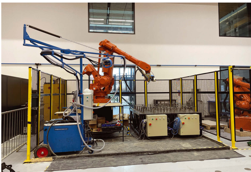
↑ FIGURE 3: Robotic cell for fabricating concrete components on adjustable mould

placements at WhitbyBird, Ramboll, Taylor Woodrow and others; I felt that I had gained a certain amount of design and site experience, so I decided to do the research instead.'