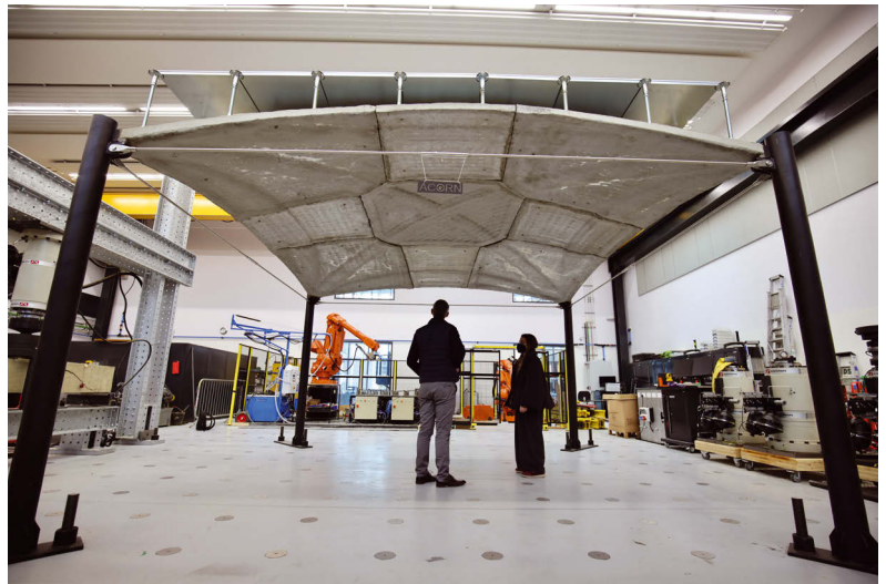
↑ FIGURE 1: Underside view of ACORN segmented thin-shell concrete floor prototype

Orr explains that the distinction between the two disciplines is deliberately blurred at Bath, an approach he strongly supports, shunning the architect/engineer label in favour of 'designer'. 'If you are going to