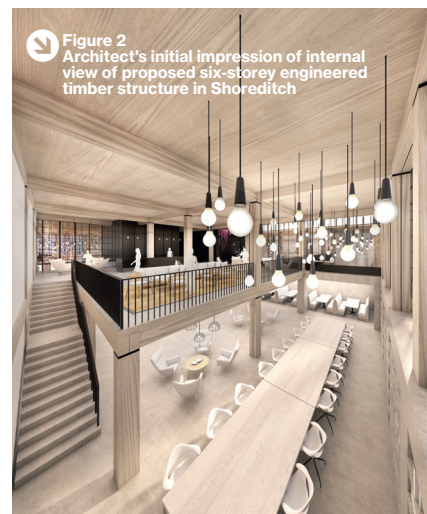
Figure 2 Architect's initial impression of internal view of proposed six-storey engineered timber structure in Shoreditch

'I spent 12 months with Abacus Design Associates in the East Midlands in my industry year. My directors there were chartered members of both institutions and I could see that doing the same would give me options in the future,' he says.