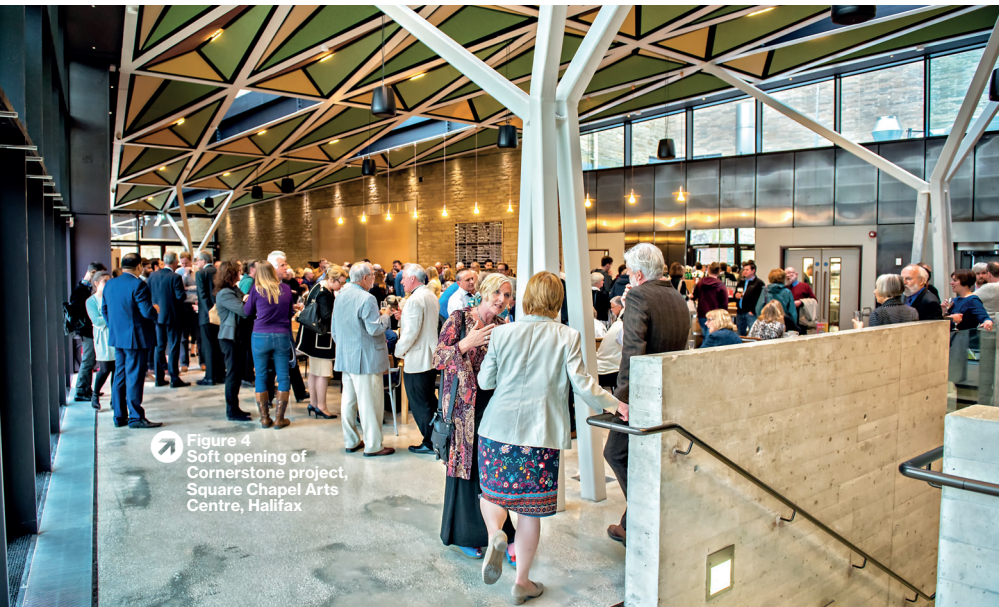
Figure 4 Soft opening of Cornerstone project, Square Chapel Arts Centre, Halifax

▶ tweet @IStructE #TheStructuralEngineer