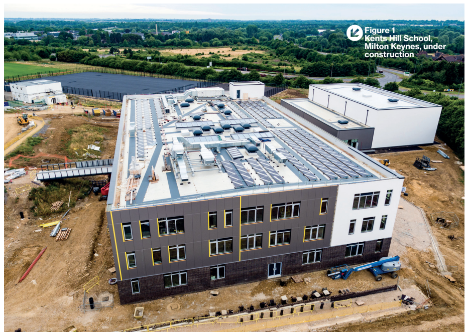
Figure 1 Kents Hill School, Milton Keynes, under construction

The decision to go for her chartership at a relatively young age was prompted by some encouragement during some time off work. 'I'd embarked on the ICE [Institution of Civil Engineers] route as it was encouraged at WSP, and seemed a quicker route to chartership, but I struggled to fit myself into the commercial boxes that it demands.