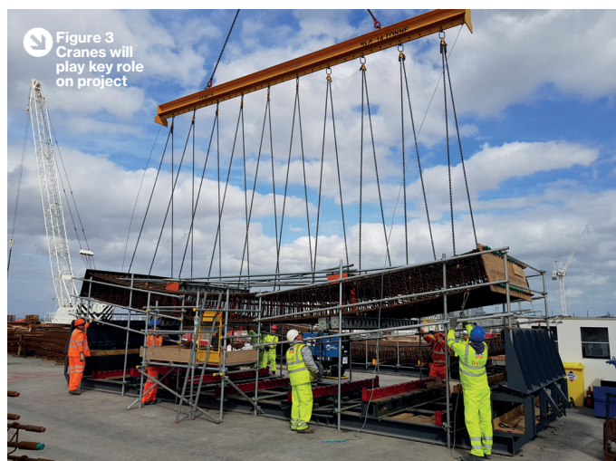
Figure 3 Cranes will play key role on project

That said, there are areas where engineering knowledge and experience are paramount. Engineers working in construction are responsible