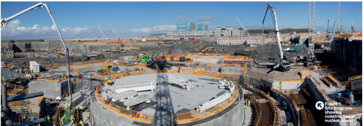
Figure 1 Site progress showing construction of nuclear island