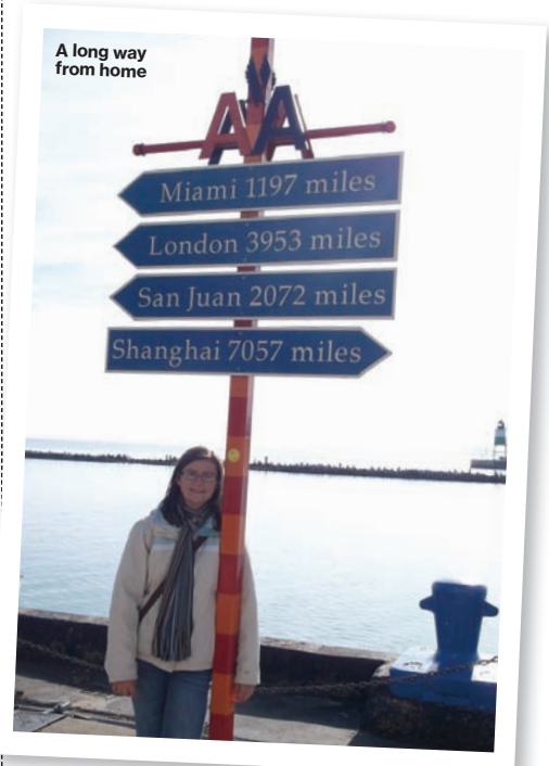
A long way from home