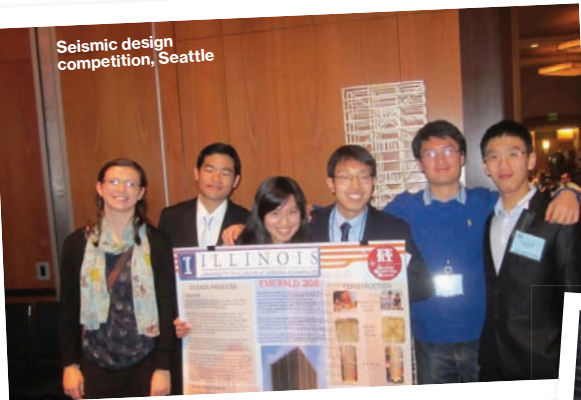
Seismic design competition, Seattle