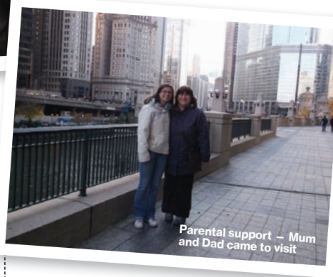
Parental support – Mum and Dad came to visit

maintenance but I could only have applied if my parents guaranteed a certain amount towards the costs."