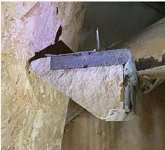
↓ FIGURE 2: Section through failed step at fracture position

injuries requiring hospital treatment, furthermore, the reporter considered that the potential for life-changing or fatal injuries was high.